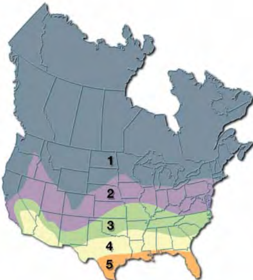
Approximate Annual Cooling Operating Costs