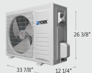
HMCG2 Horizontal Discharge A/C